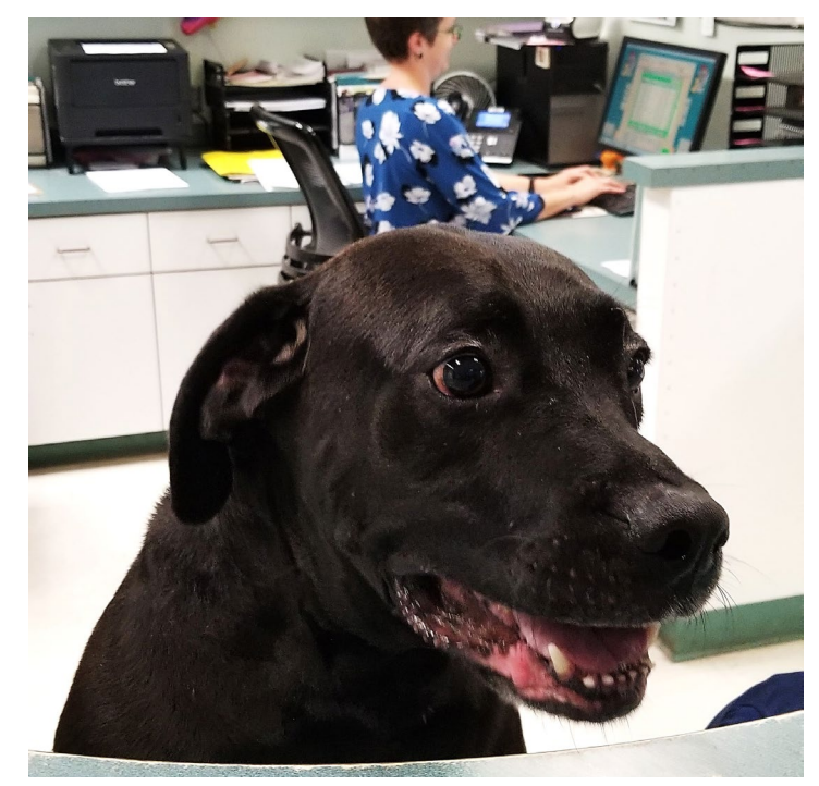
Suncoast Humane Society exists to reduce the number of homeless animals and improve the quality of life.