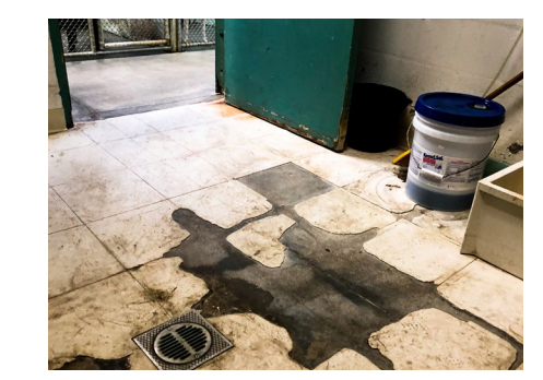
Flooring cracked and torn