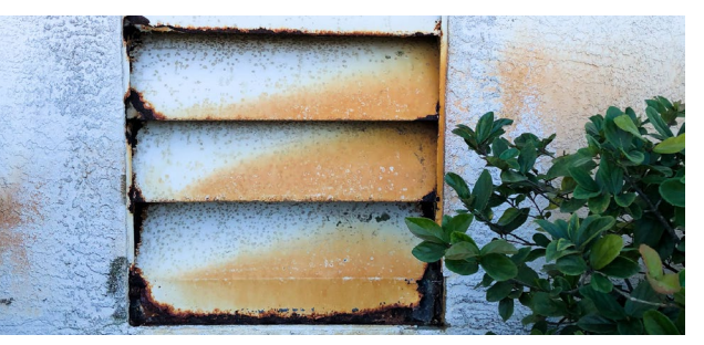
Rust and corrosion